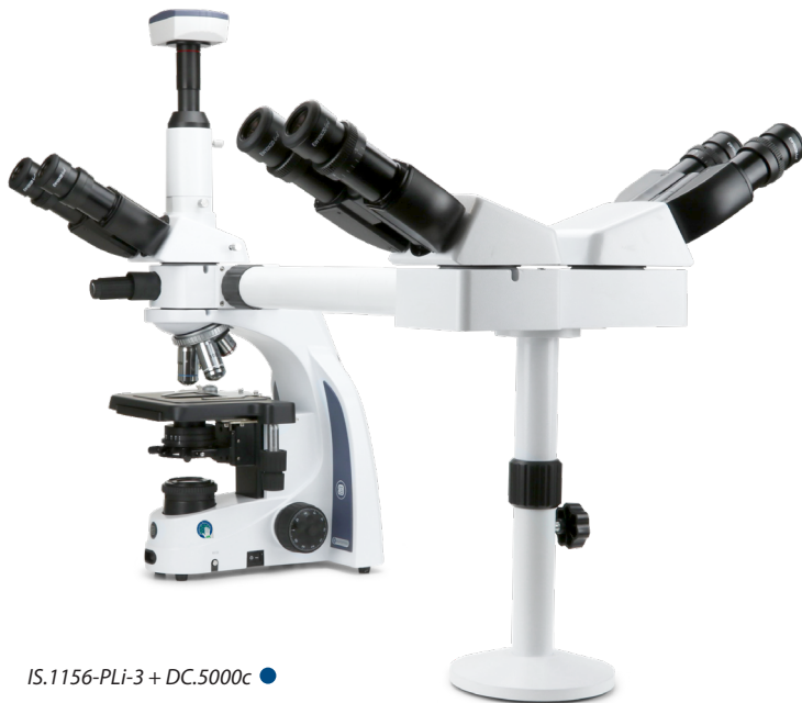
IS.1156-PLi-3 + DC.5000c ●